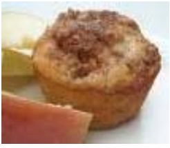
Apple Spice Muffins