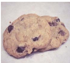
Chocolate Chip Cookies