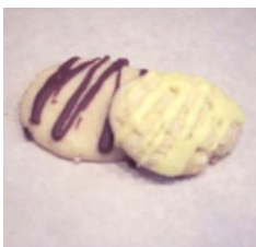
Butter Cookies (Lemon/Vanilla/Almond)