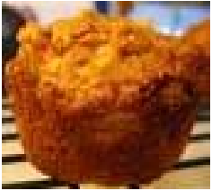
Carrot Cake Muffins