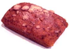
Pumpkin Walnut MiniLoaf (with Cream Cheese Frosting!)