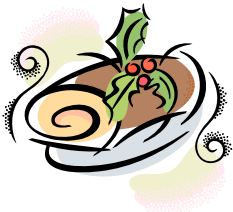
Various Pound Cakes