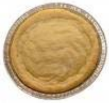
Pizza Shells – 10”