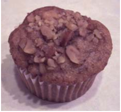
Banana Nut Muffins